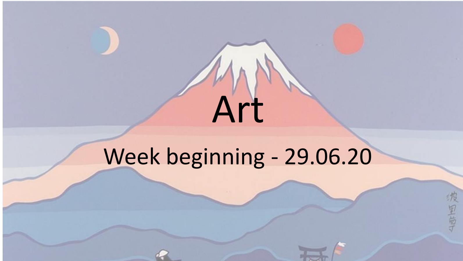
Fuji San (1987) by Ted Harrison