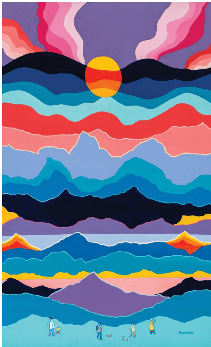
Yukon Sun, 1983

Ted Harrison was a British-Canadian artist noted for his colourful landscape paintings of the Yukon valley.